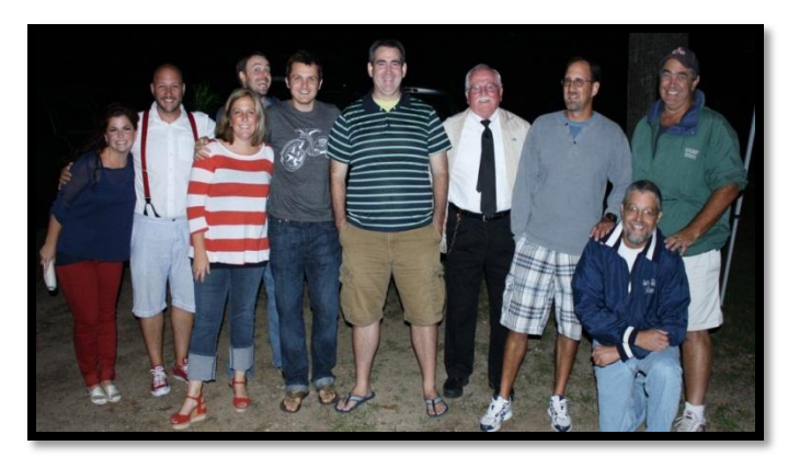
Surprise guest speakers from the past!

When I finally took the mic at the end of the evening, I said, "I have a sign hanging over the bulletin board in my office where only I can see it. The sign reads, 'How blessed am I to have something that makes saying goodbye so hard.'' I have been truly blessed. Blessed by these young people and the young people that were before them. They have been my teachers. I have learned so much from the teens that I have been with over the years.